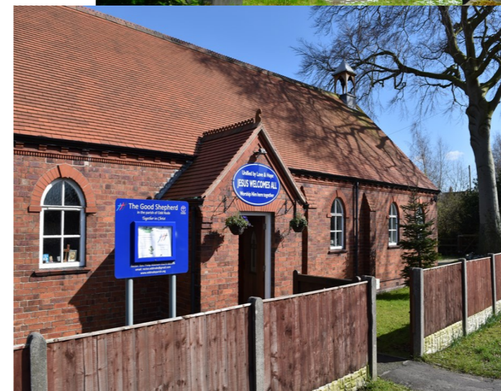
THE GOOD SHEPHERD